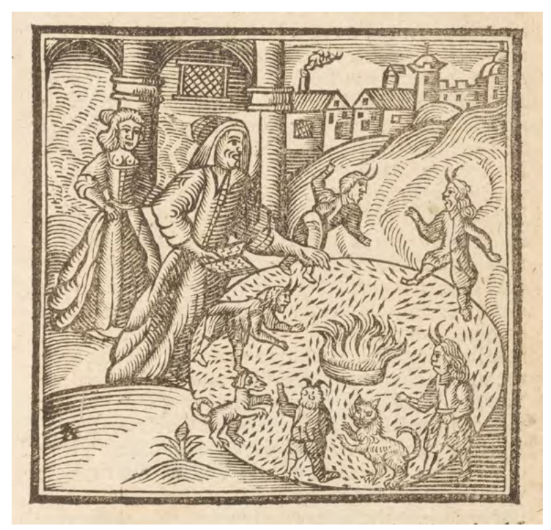
A WITCH SUMMONING DEVILS R. B. [or S.], 1632?-1725?. 1688.

Another example of the collapse of spectral figures and unknown phenomena is the witch hunting that swept across Europe and the territories and peoples it colonized between the 15th and 17th centuries, as is well documented and analyzed by Silvia Federici. In this case, the loss of population due to famine and plague was coupled with collective paranoia and fear, as incipient nation-states sought to increase their control over and supply of labor power. This manifested in the collective and violent demonizing, torturing, and killing of women over more than two centuries. The spectral figure of the witch—who would give the evil eye, make deals with the devil, kill children, and cause livestock to die or fields to wither; who would enchant men and render them impotent or steal their penises and hide them in trees—was scapegoated to explain what may have been lost or taken, to allay paranoias and fears. This socially manifested imaginary also served the purpose of helping to put women's bodies, their labor, and their reproduction under the control of state power. Here, the monstrous was instrumentalized through the space of the imaginary and violently imposed onto a specific population. The abstract spectral figure was inscribed into the bodies of countless women.